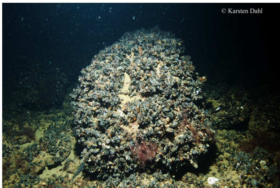
Figure 5. Stone reef at Møns Klint at 17 m depth. Common mussels dominate the biomass but between the mussels, the algae “gaffeltang” ( Furcellaria lumbricalis ) is also found.

The fish fauna will typically be relatively poor in species. The goldsinny wrasse will often be the only species from the wrasse family. The goby species will often be two-spotted gobies, black gobies and sand gobies and from the codfish family only cod will be present. Sea trout also tolerates low salinity, and they can be found on these stone reefs, particularly during winter when they migrate to areas with lower salinity. Perch is also one of the species which can be observed.