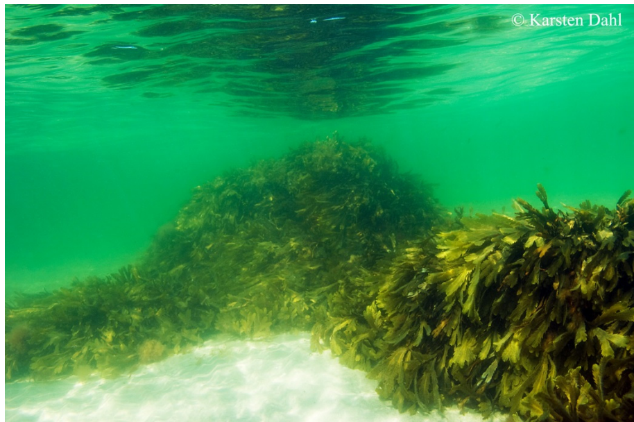
Figure 7. Algae on dispersed stones on sandy bottom close to Hornbæk Plantage.