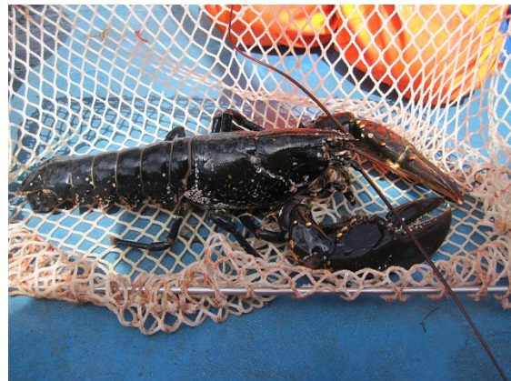
Figure 4b. Lobster.