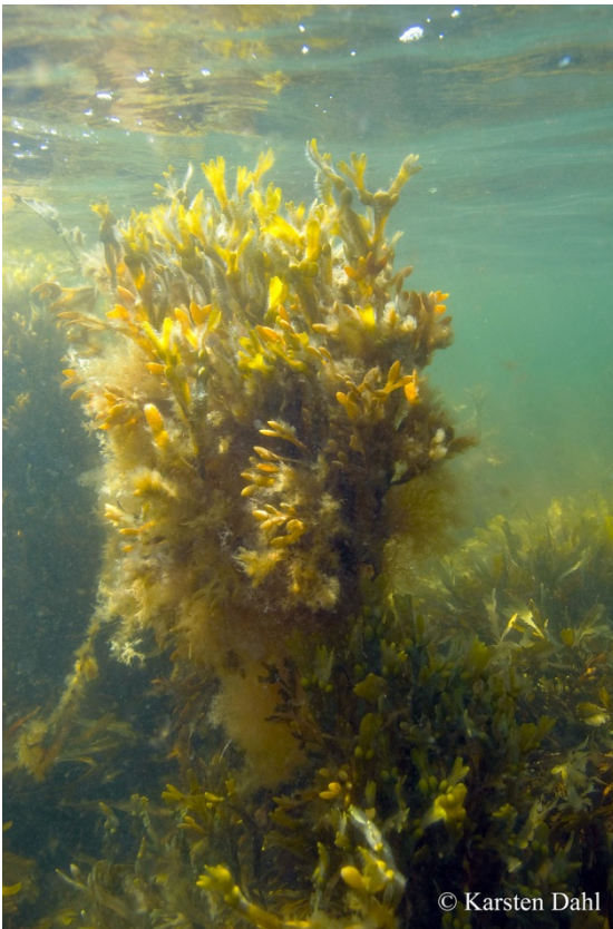
Figure 2a. Fucus community at 1½ m depth at Hellebæk north of Zealand.