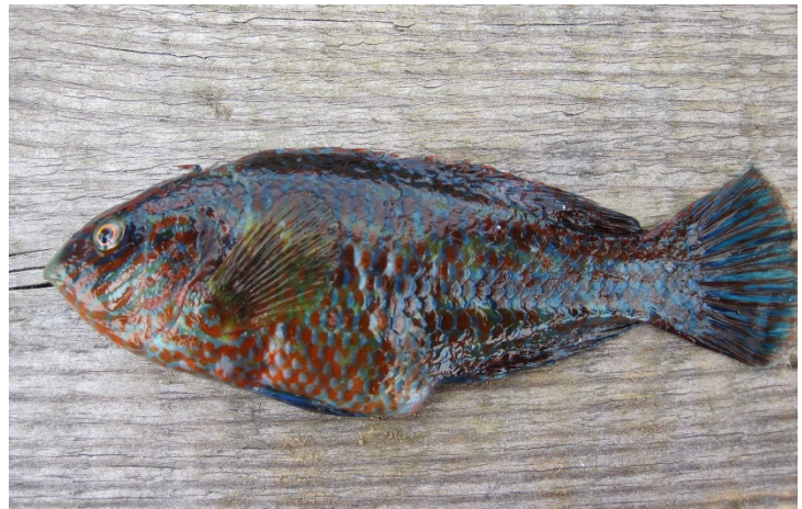
Figure 2b. Corkwing wrasse caught at Læsø Trindel.