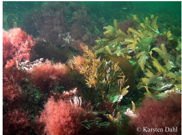
Figure 3b. Multi-layered algal community at 6 m depth from Briseis Flak in the southern part of Kattegat.