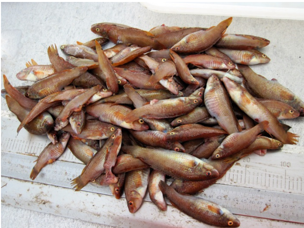
Figure 3a. Caught of Ballan wrasse.