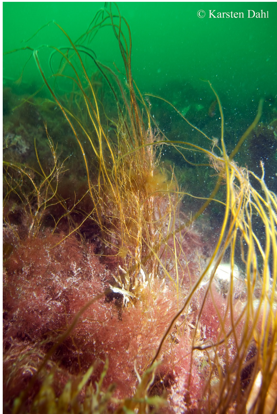
Figure 6. Algal community with typical opportunistic species. Dead man's rope (Strengetang) ( Chorda filum ) is a characteristic species for unstable bottom. Photo from Læsø Trindel at 6 m depth in 2007 before the restoration project.