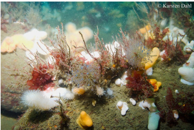
Figure 4a. Community dominated by the soft coral dead man's fingers and hydroids, which are both typical elements on the deeper stone reef. From the stone reef 'Den Kinesiske Mur' at 18 m depth.

Biological contents: hard-bottom fauna typically dominates with some algae. Typical species are moss animals at very high salinity, the soft coral dead man's fingers ( Figure 4a ) which also require relatively high salinity, a wide range of fungi and sea anemones, as well as common mussels in the western part of the Baltic Sea ( Figure 5 ). Fish fauna will be dominated by larger species from the wrasse family such as ballan wrasse, and adult codfish such as cod and coalfish. From the goby family, the sand goby and the glass goby are common. Catfish is also one of the species which can be found on the deeper stone reefs together with lobster ( Figure 4b ).